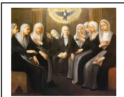
St. Angela Merici

'Disorder in Society is the Result of Disorder in The family'